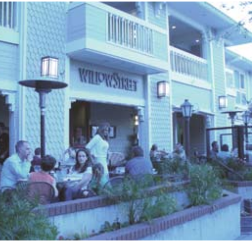
While 40 California cities/counties ban smoking at outdoor dining patios, Los Gatos is the only city in Santa Clara County to have such an ordinance.

As summer rolls around, restaurants around the Bay Area see their dining patios fill up as patrons seek a little warm weather to go along with their meal. These dining options provide a chance for those cooped up all day to get outside, even if it's just for a quick lunch break. Unfortunately, many of these patios are also home to a drifting, ever-present health risk.