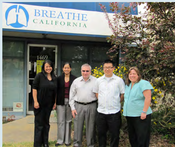
Breathe California volunteers and Interns 2010-2011