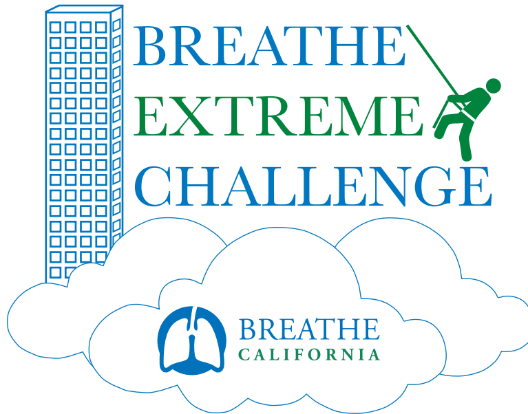
Over the Edge, Hyatt Regency Santa Clara, August 26, 2011