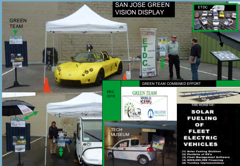
San Jose Green Team Showcase 2010

Recently, Breathe California of the Bay Area joined with the Electronic Transportation Development Center (ETDC) and the Silicon Valley Clean Cities Coalition (which it coordinates) to form The Green Team, a collaboration that advances the missions of all three groups: to advance innovation in transportation technology, reduce the use of petroleum, and reduce air pollution from transportation sources. With these complementary goals in mind, the collaborative has begun work on several projects.