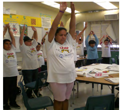
Asthma Camp for Children 2010

The agency's TB program also reached 479 adult ESL students with presentations on TB. Other lung disease highlights included Camp Superstuff summer camp for children with asthma, special focus on influenza and the H1N1 problem, and the agency's first Caregiver Training courses for 143 trainees. Almost 18,000 were served in this program area.