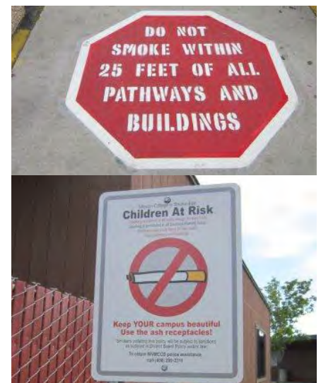
New Mission College Tobacco Policy Signs