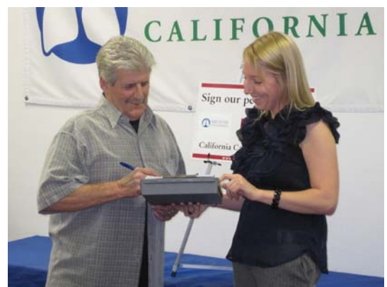
Volunteer signing the California Cancer Research Act petition.

Over the past 10 years, tobacco companies have spent 10 times as much on marketing tobacco to Californians as the state had spent on tobacco education. The CDC estimates approximately 438,000 deaths occur each year in the United States because of the effects of cigarette smoking.