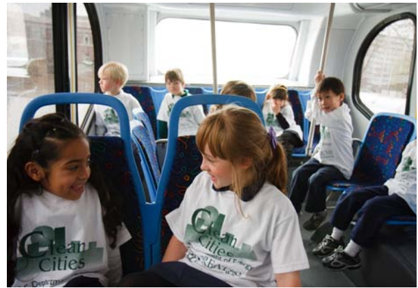
Trace Elementary kindergarten class rode the Proterra electric bus at the Clean Cities Coalition Odyssey event.

Breathe California's youngest volunteers, from Trace Elementary Kindergarten class, toured the bus and presented thoughts on why clean buses are important.