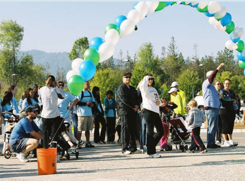
The 2009 Breath of Life Walk participants waiting to begin at the start line.