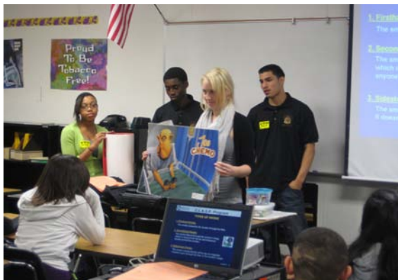
CLASP high school volunteers teach middle school students about the risks of tobacco use.

Breathe California trained high school students, who then lead a series of tobacco education classes at local middle schools. CLASP leaders learn to be responsible in protecting their own personal health and abstain from using tobacco. The 62 high school volunteer peer leaders worked with 617 middle school students, delivering four sessions of smoking prevention training to each.