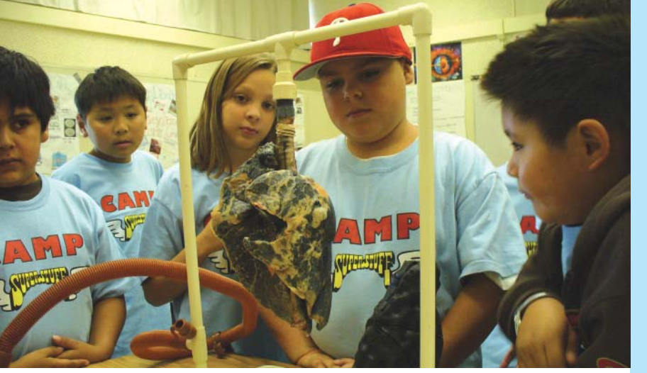
A group of kids attending this year's Camp Superstuff examine a preserved set of lungs, while a counselor demonstrates how the lungs function for those with/without asthma.