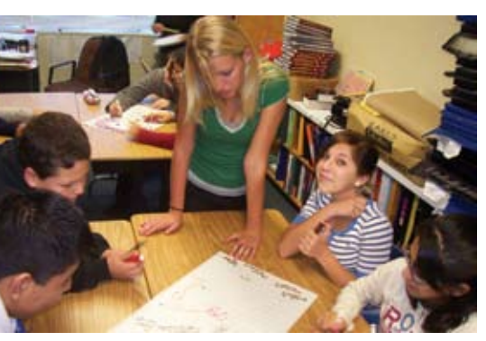
A group of River Glen Middle School students show their CLASP leader the poster they created to describe the harmful effects of tobacco use.

During the 2007-2008 fiscal year, Breathe California took its programs to new heights while also launching a number of exciting new projects: