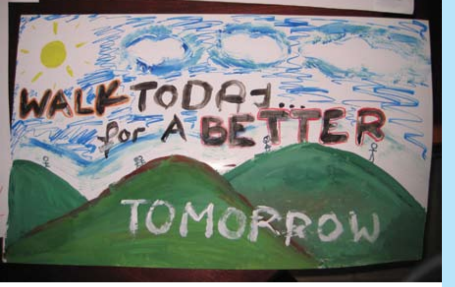
Youth for a Cool Earth participants from Milpitas High School created this poster as part of their campaign to encourage peers to reduce their carbon footprint.

The organization jumped into the battle against global warming last spring when it unveiled its new Youth for a Cool Earth program. Launched as a pilot program in Milpitas, the project seeks to engage youth in efforts to reduce greenhouse gas emissions. After recruiting a dozen students from Milpitas High School and Russell Middle School, the organization trained them on air quality issues and offered guidance as they started projects to reduce their community's carbon footprint.