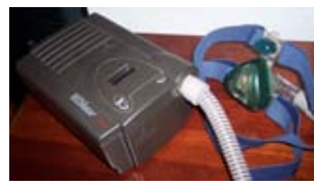
A typical CPAP machine

In an effort to help those affected by sleep apnea, Breathe California has been offering CPAP (continuous positive airway pressure) machines free of charge to those in need. Here are comments from clients who received CPAPs from Breathe California: