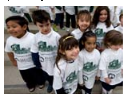
Local school children prepare to ride in an electric school bus

This past year, Breathe California worked with The Boys and Girls Club to provide the Counseling Leadership Against Smoking Pressure (CLASP) peer-led smoking prevention program for 822 middle and high school students, 69 percent of whom showed a gain in knowledge and 28 percent of whom reduced their susceptibility to using tobacco.