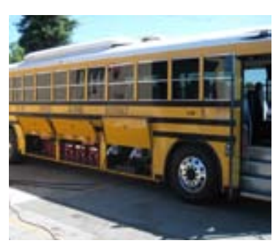
Fully electric school bus, recharging via solar panels

The agency also convinced four multi-unit housing