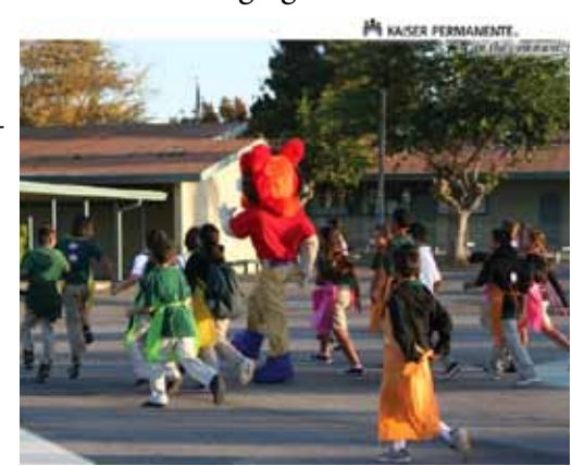
Students & Kaiser mascot at a Walking Wednesday

more visible to traffic, and the collaboration of their Super Weevil program mascots that were so popular with the students. In another effort to help