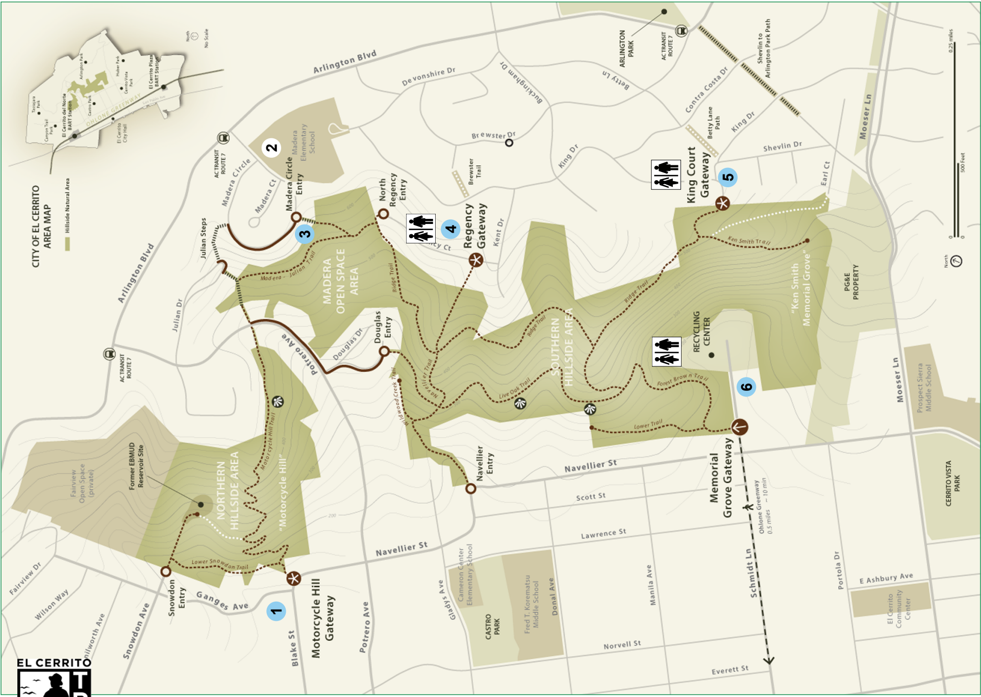
CITY OF EL CERRITO AREA MAP