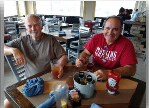
Everyone is all smiles to have a nice dinner and a fun evening!