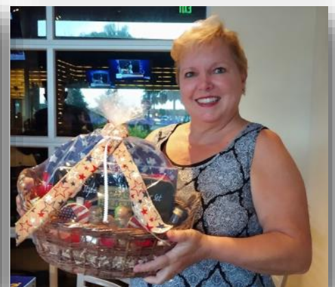
Our hostess got in on the action and won the 50/50 drawing! Congratulations!!