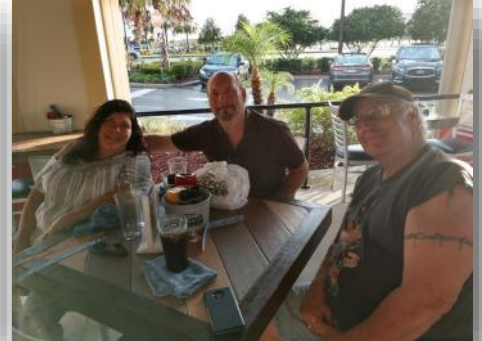
Our Gatherings always include time for BAM! Members and friends to say hello, catch up on ...