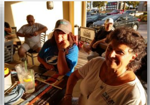
...what has been going on with each of us, and finding out who has had the latest Mustang adventure.