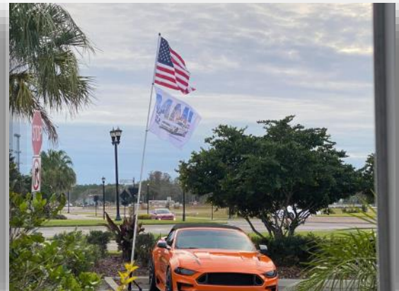
Our favorite watering hole, Ford's Garage in Wesley Chapel.