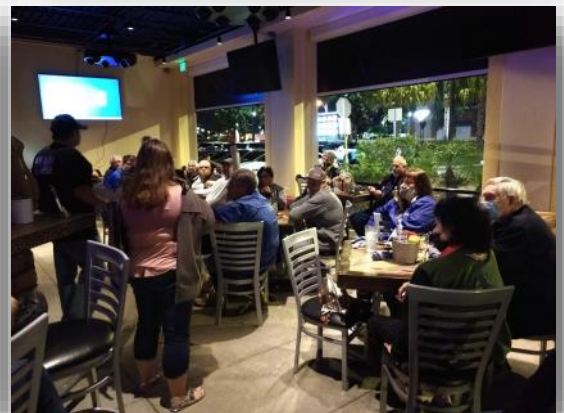
Fun with games and a very happy group of Mustang Enthusiasts.