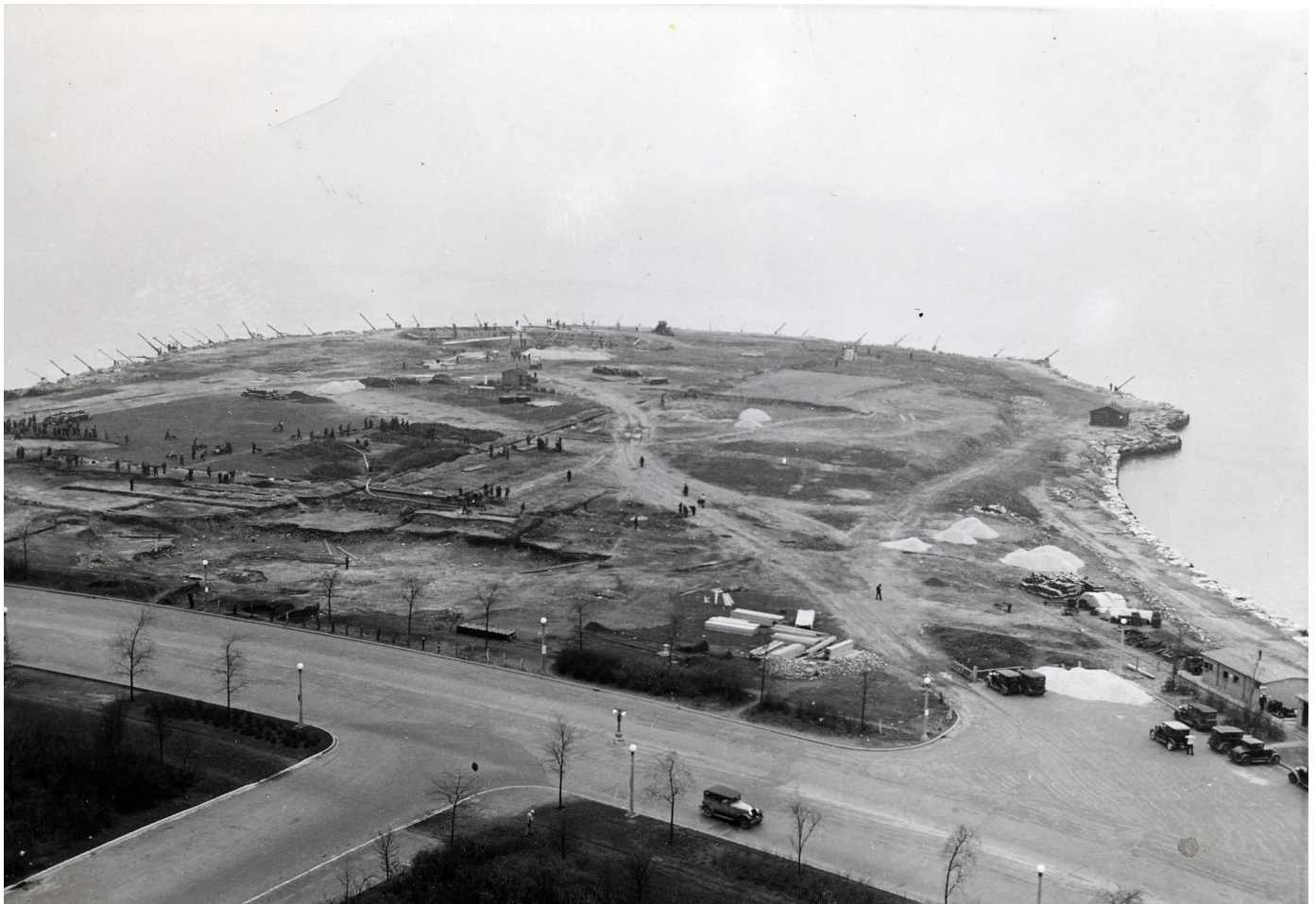
Figure 4. Aerial view of Promontory Point showing underway to complete revetments and grading, 1936, Chicago Park District Records: Photographs, Chicago Public Library Special Collections

Section number Additional Documentation Page 35