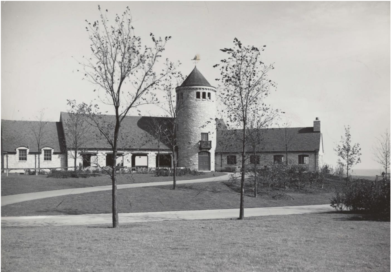
Figure 9. Promontory Point Pavilion, ca. 1940, Chicago Park District Records: Photographs, Chicago Public Library Special Collections.

Section number Additional Documentation Page 39