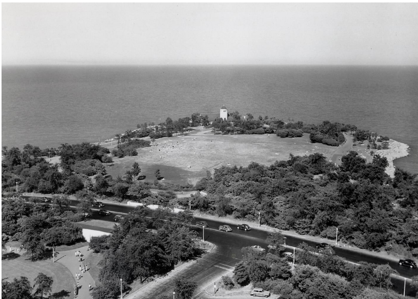
Figure 10. Aerial view of Promontory Point, ca. 1945, Chicago Park District Records: Photographs, Chicago Public Library Special Collections.