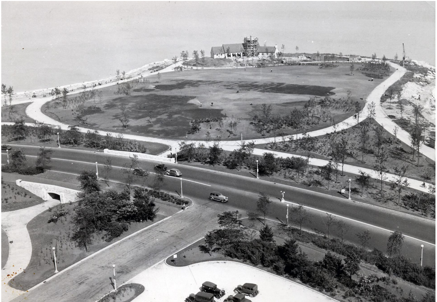
Figure 5. Promontory Point landscape and pavilion construction, 1937, Chicago Park District Records: Photographs, Chicago Public Library Special Collections.

Section number Additional Documentation Page 36