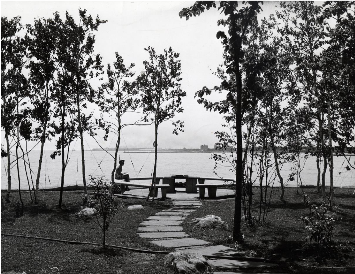
Figure 8. Hexagonal concrete bench and bluestone path, 1939, Chicago Park District Records: Photographs, Chicago Public Library Special Collections.

Section number Additional Documentation Page 38