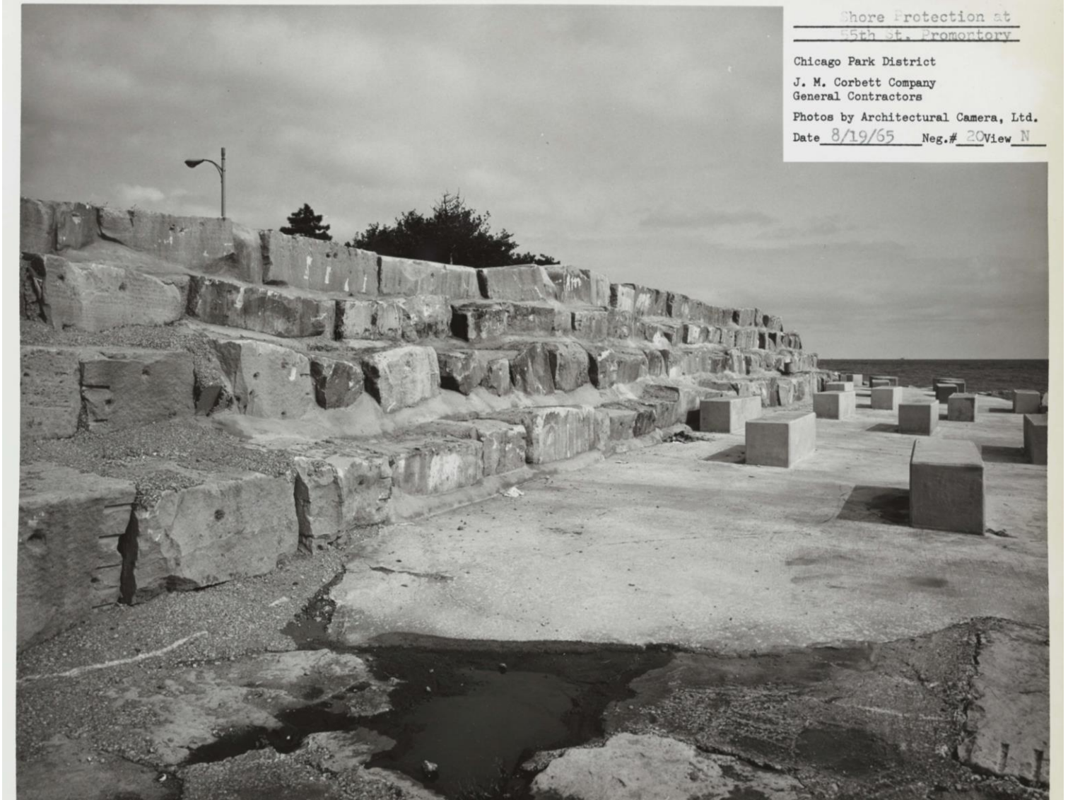
Figure 11. Promontory Point revetments showing repairs including concrete platform and deflectors, 1965, Chicago Park District Records: Photographs, Chicago Public Library Special Collections.

Property name: Promontory Point Historic District Illinois, County: Cook