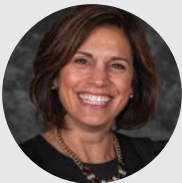
HONORABLE MARY DEBOER Porter County Circuit Court Judge

"Women United is the place for me because I love the mission of serving other women. The idea of women tearing each other down is often discussed. It's powerful to be a part of something that shows that the opposite can be true. It's also really cool to see how engaged the volunteers get for Monday night classes. I've been inspired by the creativity and unique backgrounds and perspectives each person brings."