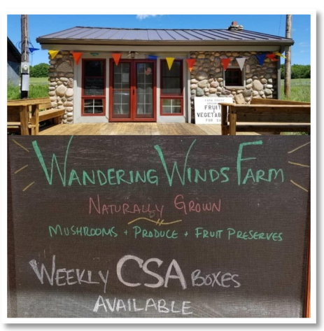
Wandering Winds Tiny Farm Store

A: Thank you! It would be nice to someday offer other farmer's products at our store (we are not currently equipped to do so) in order to provide a more complete shopping experience to our customers as we aren't able to do everything. Of course we as small farmers need multiple outlets and it would be helpful if there was a local foods distribution business we could work with to help spread our product around. We do offer wholesale quantities (and prices) for mushrooms and are able to accommodate custom grow requests with enough lead time. We work with