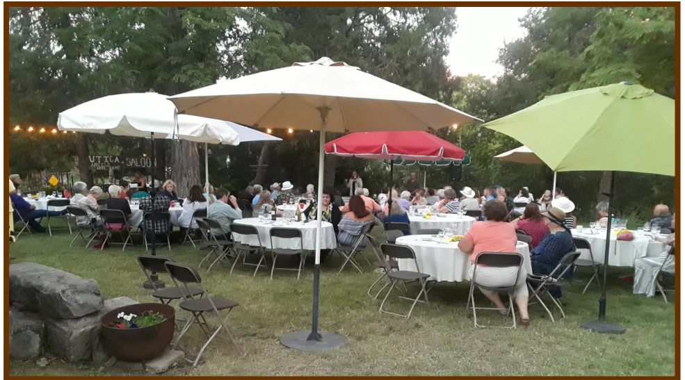
The weather was perfect and the food, catered by The Pickle Patch was delicious.

On September 8th, the Folendorf Family graciously allowed Angels Camp Museum Foundation guests access to their home, the Utica Mansion. The original, Federal style, stone house was built in the late 1860's. When Utica Mine owner, Charles Lane, finally hit pay dirt, he purchased the home and in 1890 undertook an elaborate remodel which doubled the size and transformed it into the Mansion we see today.