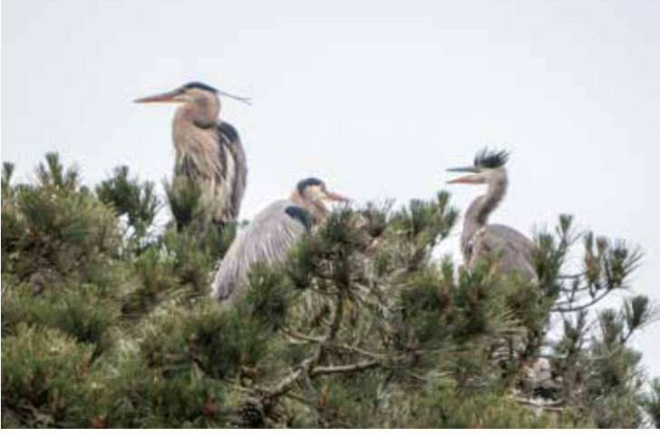
Heron chick (with mohawk) with parents