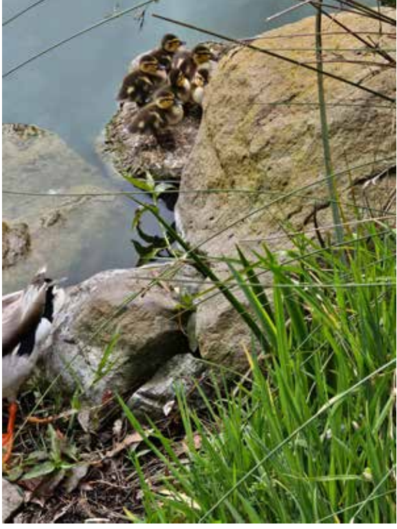
Six new Mallard ducklings