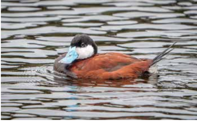
Ruddy Duck in breeding plumage

Binoculars loaned as available to participants Don't forget water and snacks.