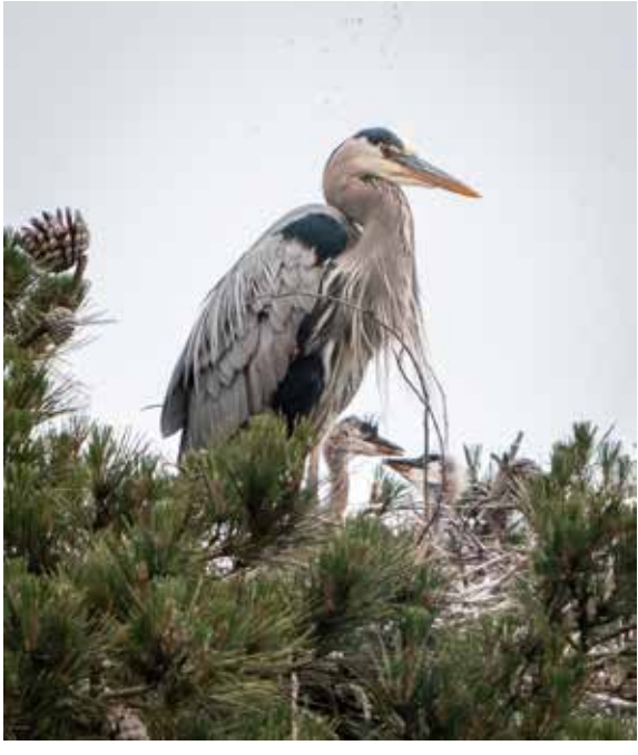
Two heron chicks in nest at Boathouse