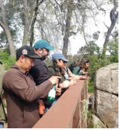
Checking the Waterfall for bathing hummingbirds

Two Saturdays left to view the herons and chicks through our Spotting Scopes from 10-1pm: May 10 & May 17. Field trips for families with children 5-12 still open. Beginning birding for Adults and Teenagers still open. Check our website under Field Trips.