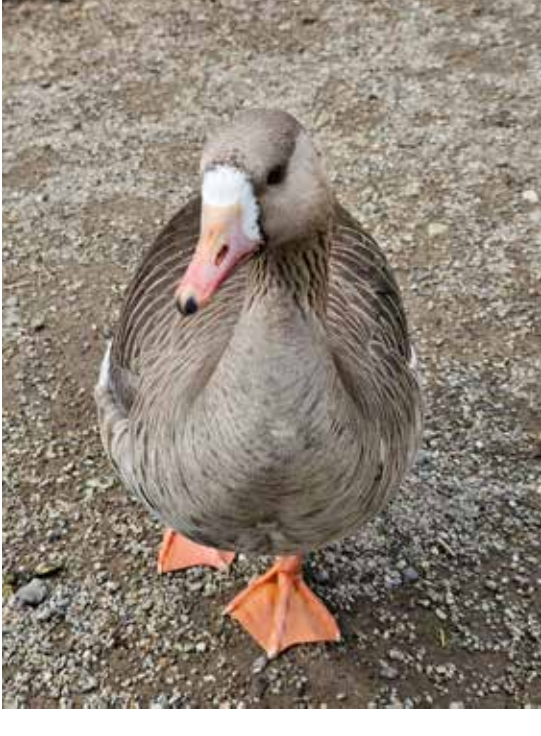
White-fronted Goose at Blue Heron Lake - Dan Seiden