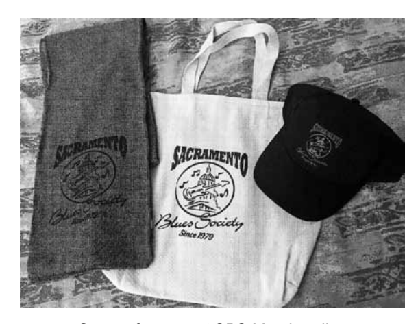
Some of our great SBS Merchandise

truly muster in my heart is his line, "Thank you, baby."